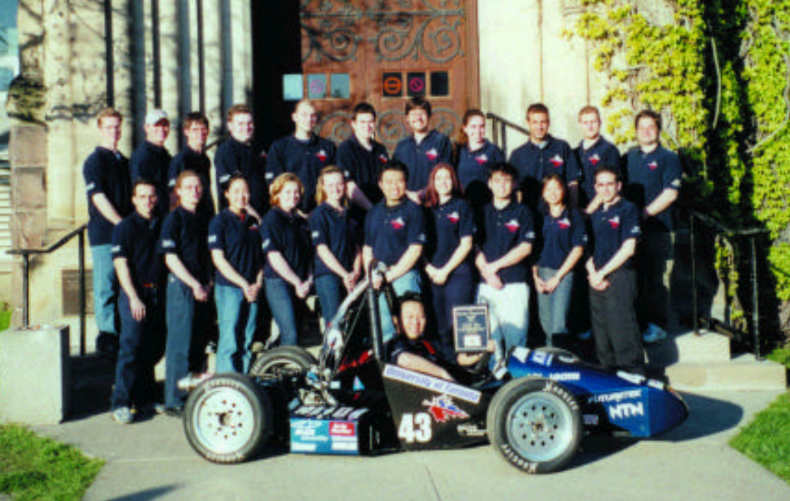
2003 Formula SAE Racing Team

The University of Toronto Formula SAE team challenges students to exercise their knowledge, creativity and skill by designing and building a single-seater race car for annual international competitions held in Pontiac, Michigan and Birmingham, England. The project requires technical knowledge, business acumen, and good communication within the team and with industry. Our students have a superb track record, last year placing second overall out of a field of 30 teams in the British competition.