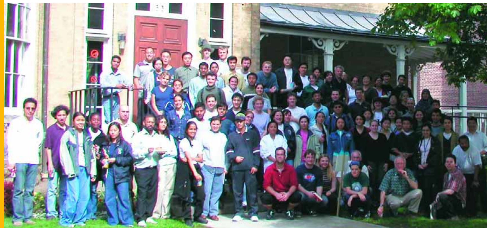
Annual Spring Cleaning Day, June 2003

200 College Street Toronto ON Canada M5S 3E5 T 416 978 3063 F 416 978 8605 E chair@chem-eng.utoronto.ca