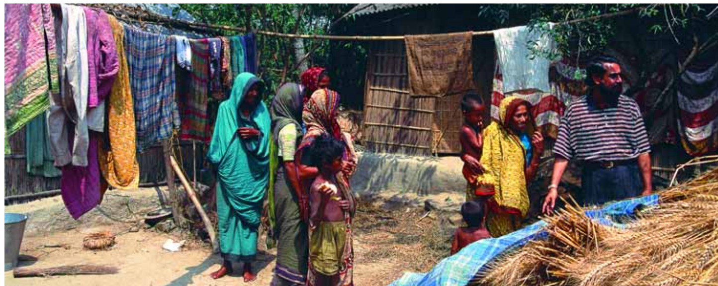
An international team, planning the large-scale testing of double-fortified salt, visiting a Bangladesh village