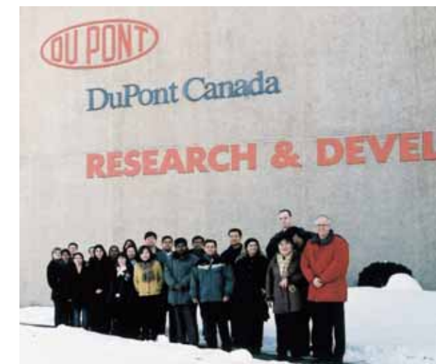
Graduate Student Technology Tour, Kingston, Ontario

The inaugural Technology Tour was a huge success. All of the participants agreed that it was a valuable learning experience which enhanced their professional development and provided an opportunity to socialize with colleagues. The lessons learned in the planning and implementation of the tour will be applied to future annual tours.