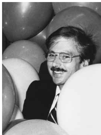
Iron Ring prank 1981